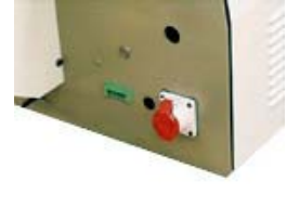
Easy connection for additional feeder and trimmer for your increasing customer demands.