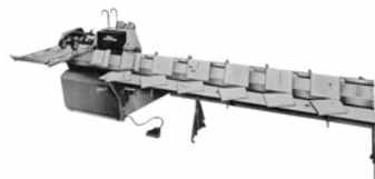
Shown with 213 Saddle Extension