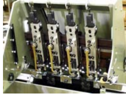
Up to 4 stitching heads can be used at one time. Easily adjustable and removable.