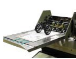
Positive delivery with single lever thickness adjustment of rollers assures positive book control throughout delivery.