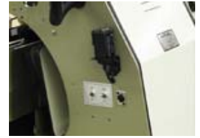
Sensor detects missing signatures over saddle and prevents stitching heads to stitch without a book present.