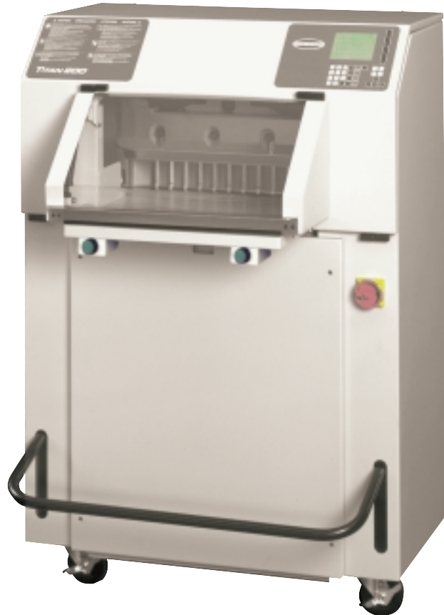
Titan 200 above is shown with the plexiglas cut control safety shield. (Titan 265 on cover is shown with the Category 4 light curtain safety beams)